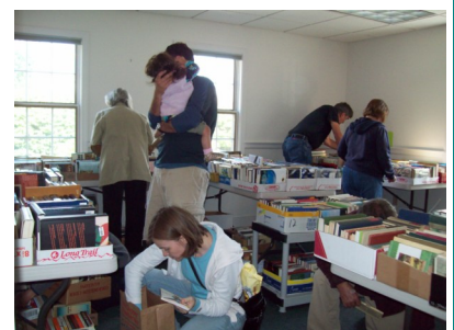
Book Sale continued on 2

exponentially. Sometimes it was necessary to sort books two or three times in one week. Often, at the end of a sorting session, there would be 30-50 boxes of books ready for storage. And the