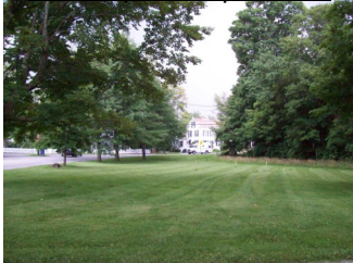
Land Parcel Looking Towards Rt. 7A