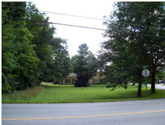
Cemetery Rd. Proposed Site