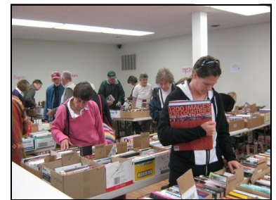
Book Sale continued on 2

who generously shared their leftover books with us. The books were arranged in specific categories, not just general genres. To further aid shoppers, we alphabetized books in some areas and grouped works of prolific authors.